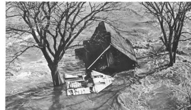
FIGURE 9.—Many homes in Lilydale, Minn., were damaged beyond repair.

On April 7, 1965, the small community of Lower Lilydale was devastated by the surging Mississippi River, forcing the 150 residents to evacuate. The flood caused catastrophic damage, leaving more than half of the homes destroyed or severely impacted. While some families never returned, others found a way to adapt—living in trailers that could be