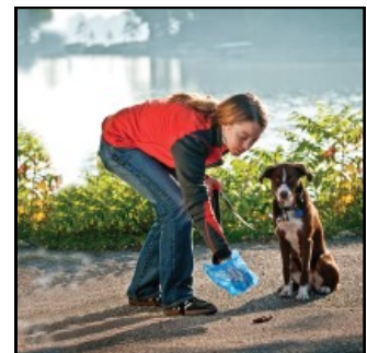
Dog poop carries harmful bacteria. Pick up after your pet.